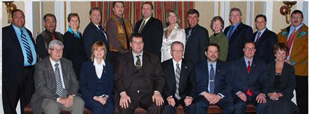
Council of Education Ministers, Canada with National Aboriginal Organization representatives